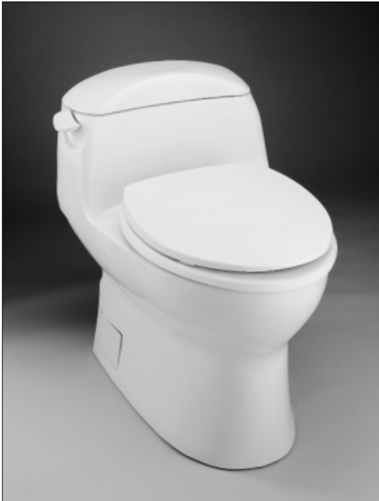
MS914114 - Dorian Toilet with SoftClose Seat